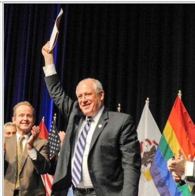
Gov. Pat Quinn raises SB10 in triumph after affixing his signature to the official document.