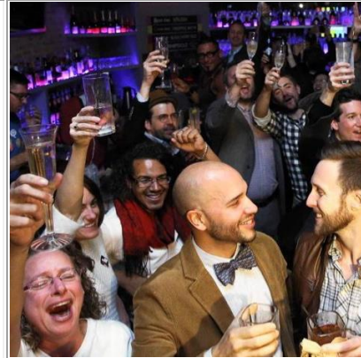
Impromptu Sidetrack party when bill passes. ( Chicago Tribune coverage. )