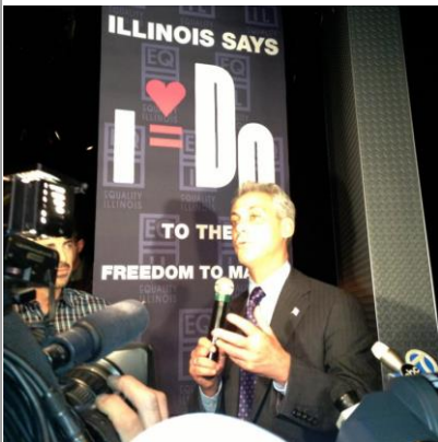
Chicago Mayor Rahm Emanuel dropped in at the impromptu Sidetrack party, where hundreds of celebrants joined to toast the victory as Chicago's media recorded the joyous reaction.