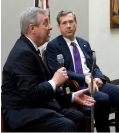
U.S. Senators Dick Durbin and Mark Kirk discuss issues with Illinois constituents at a recent forum on Capitol Hill.

THE WORKPLACE = The Employment Non-Discrimination Act, which would prohibit non-religious companies from discriminating in hiring and on the job based on sexual orientation and gender identity, was introduced with Republican U.S. Senator Mark Kirk of Illinois as one of the five original co-sponsors of the Senate version. A House version was also introduced with Reps. Tammy Duckworth, Luis Gutierrez, Bill Foster, Mike Quigley, Bobby Rush, Jan Schakowsky and Brad Schneider , all Democrats, signing on as original cosponsors.