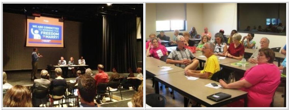
The Center on Halsted was the site for a community meeting in Chicago.