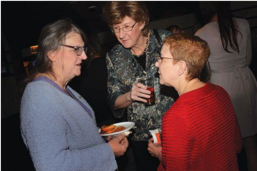
TRANSGENDER COMMUNITY SOCIAL = One of our favorite winter events, the 2013 Transgender Community Social, was held at Mayne Stage in Chicago on Saturday, Jan. 19. A great turnout enjoyed a fun afternoon of tasty light bites, drink specials, and great raffle giveaways.