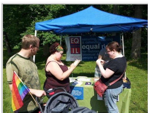
Getting involved at the Rockford Pride Fest, one of the many local events Equality Illinois goes to each summer during Pride season.

The festivals are fun, but they're also about getting involved and informed about the issues important to LGBT Illinoisans. Be sure to take part at your local events.