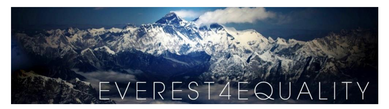
Everest 4 Equality Kick Off Party: A Night at the Gallery

Last year's Pride Parade was fun and meaningful. <u>See more pictures</u> <u>here.</u>