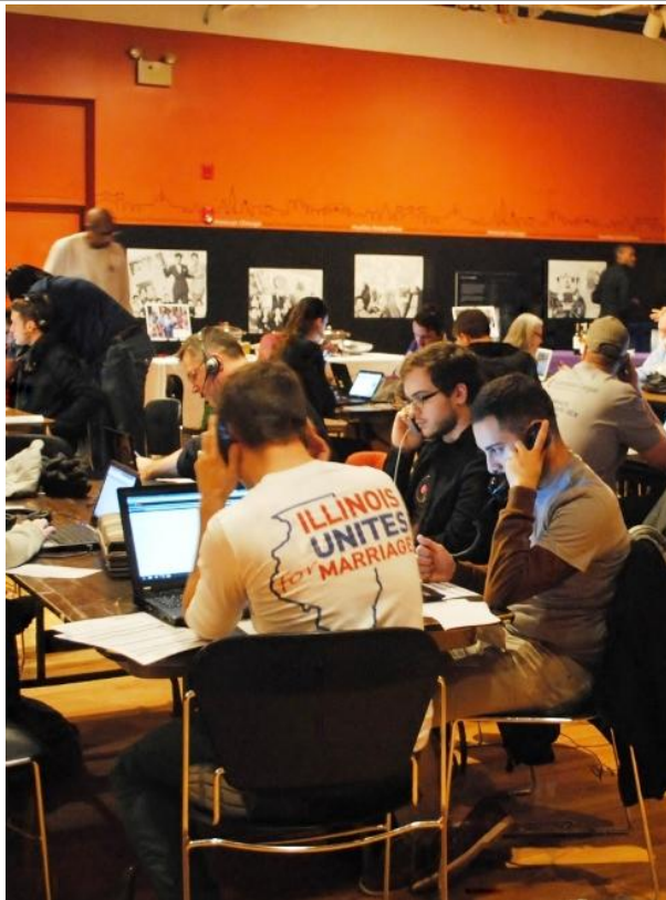
Volunteers calling supporters at one of over 70 phone banks to urging voters to contact their representative.